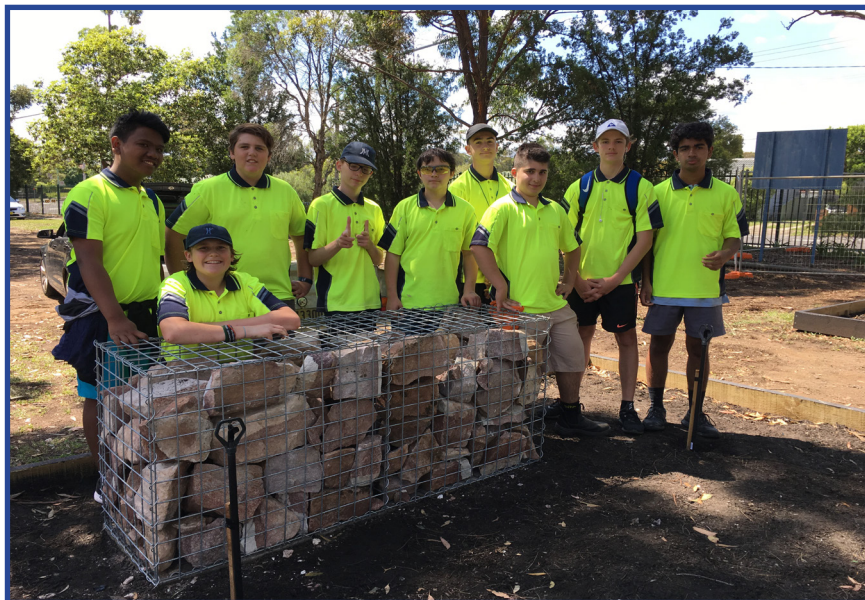
A big thank you too the MHS CREW for their hard work on maintaining our school grounds.

The HSC examinations are now all completed. The past twelve months has been stressful for both the students undertaking the HSC and their families. I would like to congratulate year 12 for lasting the distance and their families for supporting them throughout. A huge thank you must go to all the teachers who sweated over preparing the students for the examinations, they worry and fret each and every year in preparing the students. Some will be happy and some disappointed with their final result but we need remember that the HSC is not the be all and end all there are many pathways to achieving ones final destination.