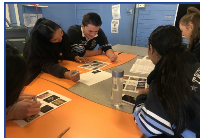
by PBL Roll call students