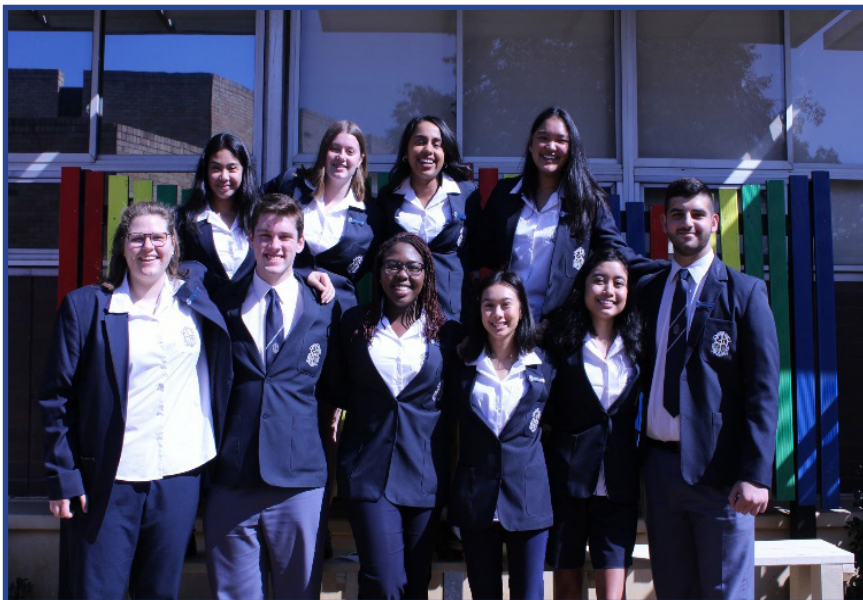
Congratulations to our new MHS Leadership Body for 2019.