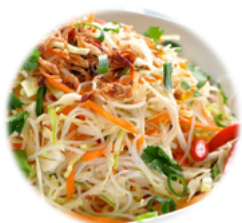
VIETNAMESE NOODLES 1720KJ VERMICELLI NOODLES, CHICKEN, ROAST CAPSICUM CARROT CUCUMBER, RED ONION