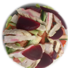
SUMMER CHICKEN 1450KJ FRESH CHICKEN BREAST, MIXED LETTUCE TOMATO, CARROT, CUCUMBER, BEETROOT