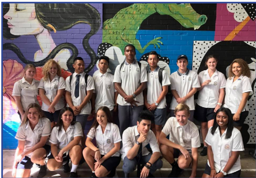
2017 House Captains