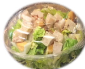
CHICKEN CAESAR 1685KJ FRESH CHICKEN BREAST, MIXED LETTUCE EGG, BACON, CROUTONS, CHEESE