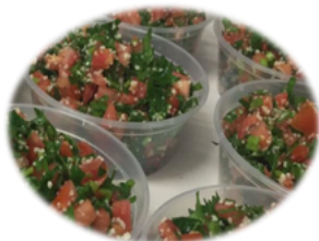
TABOULI 680KJ DICED TOMATO, CORIANDER, PARSLEY SPRING ONION LEMON INFUSION