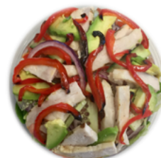
CHICKEN AVOCADO 1530KJ FRESH CHICKEN BREAST, MIXED LETTUCE, AVOCADO ROAST CAPSICUM, TOMATO, CUCUMBER