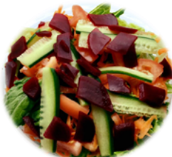
GARDEN 815KJ MIXED LETTUCE, TOMATO, CARROT CUCUMBER, BEETROOT