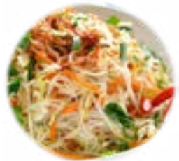
VIETNAMESE NOODLES 1720KJ VERMICELLI NOODLES, CHICKEN, ROAST CAPSICUM CARROT CUCUMBER, RED ONION