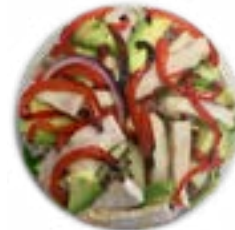
CHICKEN AVOCADO 1530KJ FRESH CHICKEN BREAST, MIXED LETTUCE, AVOCADO ROAST CAPSICUM, TOMATO, CUCUMBER