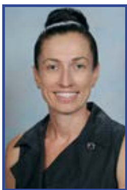
Mrs Spadina Head Teacher PDHPE

Don't forget PE uniform is compulsory for all practical lessons. This includes joggers (no canvas shoes), MHS blue PE shorts, MHS white PE shirt and the MHS hat. With the hot weather around we strongly suggest students also bring out a water bottle to each lesson.