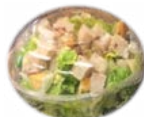
CHICKEN CAESAR 1685KJ FRESH CHICKEN BREAST, MIXED LETTUCE EGG, BACON, CROUTONS, CHEESE