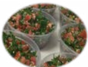
TABOULI 680KJ DICED TOMATO, CORIANDER, PARSLEY SPRING ONION LEMON INFUSION