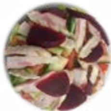
SUMMER CHICKEN 1450KJ FRESH CHICKEN BREAST, MIXED LETTUCE TOMATO, CARROT, CUCUMBER, BEETROOT