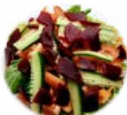
GARDEN 815KJ MIXED LETTUCE, TOMATO, CARROT CUCUMBER, BEETROOT